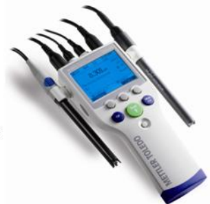
The NEW SG68