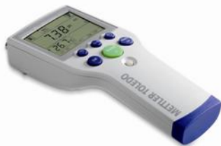
The NEW SG23

The new SevenGo Duo™ are a mid-range of dual channel portable meters for pH and conductivity measurements. They are ergonomic in design and have a simple user interface for efficiency in the field and come with Intelligent Sensor Management® for extra security. Other features include:-